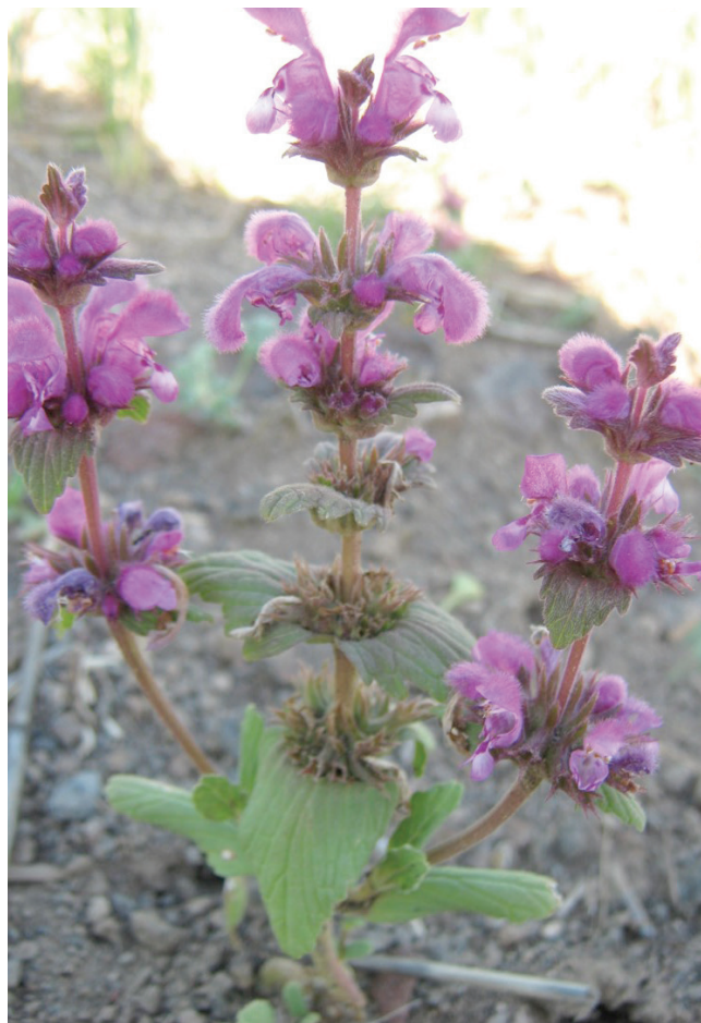
Figure 13. Wiedemannia orientalis