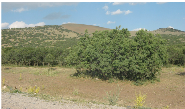
Figure 6. A view of Quercus pubescens community (Acıgöl)