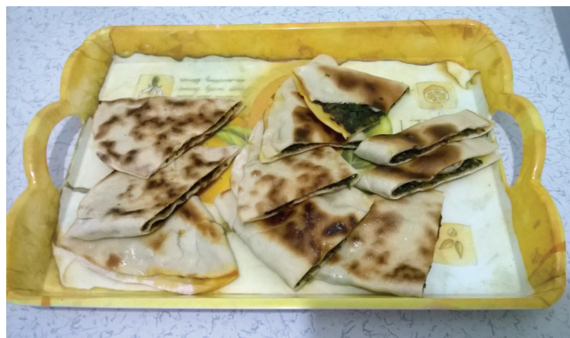
Figure 8. Pita made with nettle ( Urtica dioica )