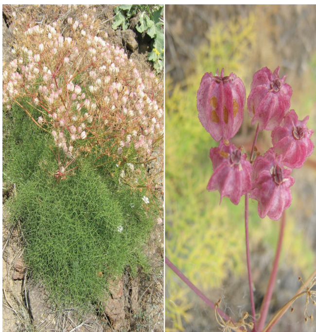
Figure 12. Prangos uechtritzi