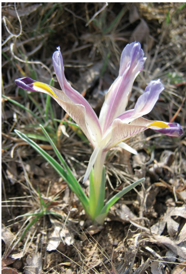
Figure 11. Iris galatica