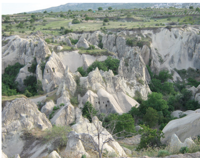
Figure 3. A view from Göreme (Nevşehir-Central District)