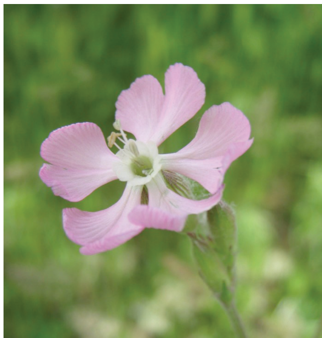
Figure 10. Silene subconica