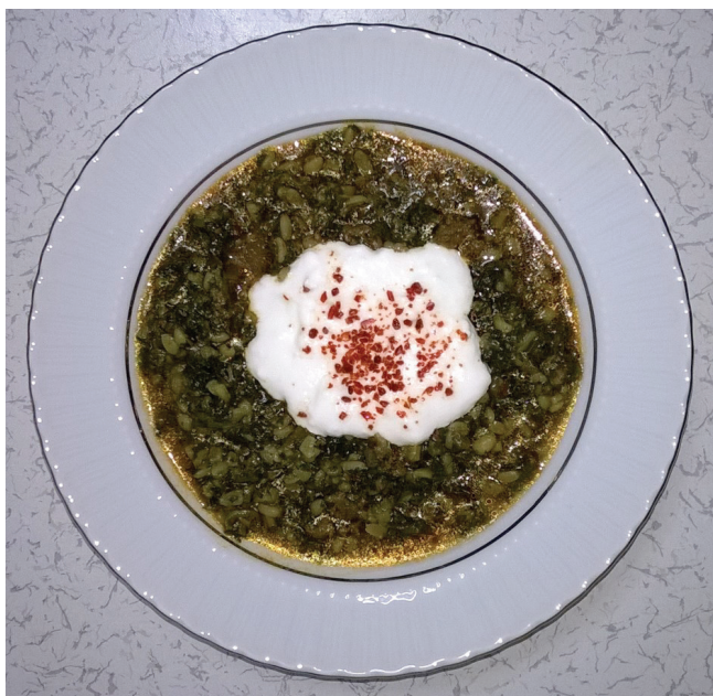
Figure 7. A dish made with nettle ( Urtica dioica )