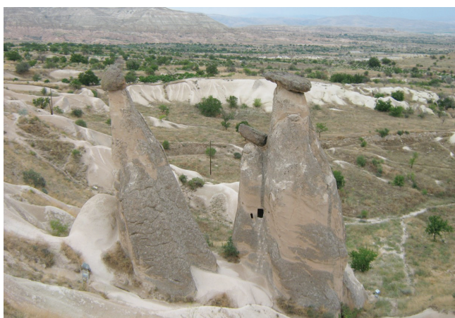
Figure 2. Fairy chimneys (Ürgüp)