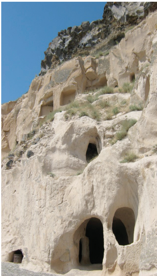
Figure 4. Entrance of Tatlarin Underground City (Acıgöl)