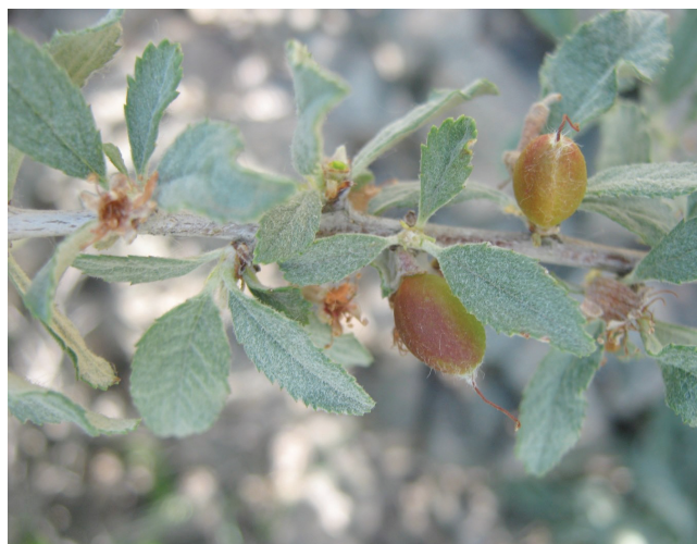
Figure 9. Cerasus incana var. velutina