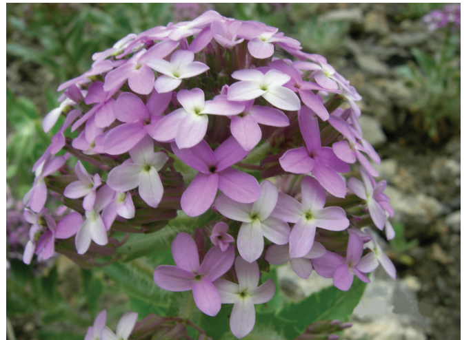
FIGURE 7. Tchihatchewia isatidea-2