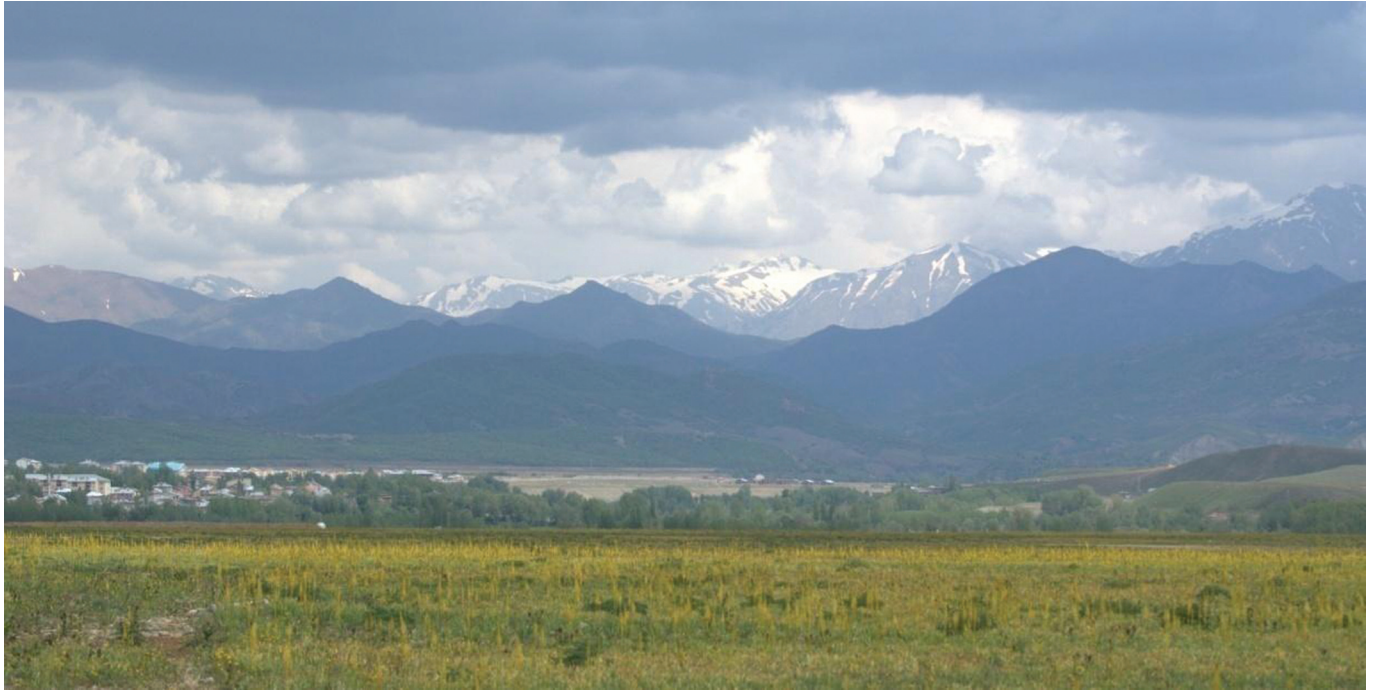
FIGURE 2. Ovacık and Munzur Mountains

According to the comparison (Table 2) with the other local ethnobotanical studies (3,4) in the eastern Anatolia, there are only three plants ( Achillea biebersteinii , Plantago major subsp. major , Urtica dioica ) which are using with the same purposes in Ovacık (Tunceli), Kürecik (Malatya) and Ilıca (Erzurum). These plants and their similar usages are also recorded in the other places in Turkey: Achillea biebersteinii (Isparta), Plantago major subsp. major (Giresun, Trabzon), Urtica dioica (Balıkesir, Çanakkale, Giresun, Isparta, İstanbul, Muğla, Trabzon) (5). In addition, in thirteen plants of the Table 2, there are also some similar usages in two localities.