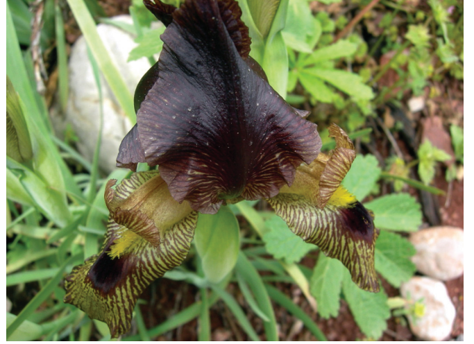
FIGURE 4. Iris sari