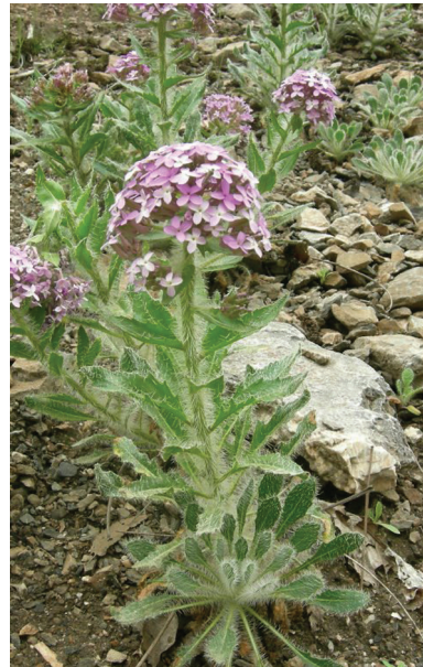
FIGURE 6. Tchihatchewia isatidea-1