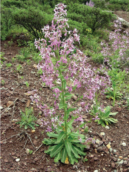
FIGURE 5. Hesperis schischkinii