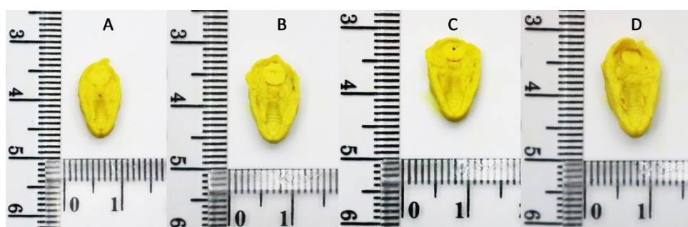
Figure 2. Normal palate of the fetus of (A) control, (B) WESAL 100 mg/kg bw, (C) WESAL 400 mg/kg bw, and (D) WESAL 1000 mg/kg bw group; WESAL : Water Extract of Sonchus arvensis - Anredera cordifolia Leaves

Hc: hydrocephalus; Ey: eye; Uj: upper jaw; Hr: heart; Lv: liver; Kd: kidney; Tt/Ov: testicles/ovary; Ln: lung; Fl: forelimb; Hl: hindlimb; Tl: tail; WESAL : Water Extract of Sonchus arvensis - Anredera cordifolia Leaves