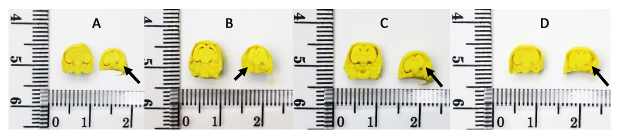
Figure 2. Small brain of the fetus found in (A) control, (B) WESAL 100 mg/kg bw, (C) WESAL 400 mg/kg bw, and (D) WESAL 1000 mg/kg bw group; WESAL : Water Extract of Sonchus arvensis-Anredera cordifolia Leaves