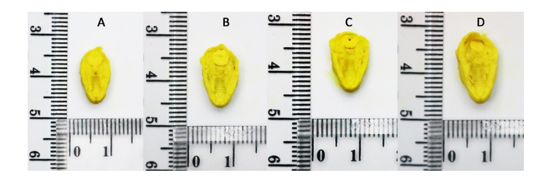
Figure 2. Normal palate of the festus of (A) control, (B) WESAL 100 mg/kg bw, (C) WESAL 400 mg/kg bw, and (D) WESAL 1000 mg/kg bw group; WESAL : Water Extract of Sonchus arvensis-Anredera cordifolia Leaves

Hc: hidrocephalus; Ey: eye; Uj: upper jaw; Hr: heart; Lv: liver; Kd: kidney; Tt/Ov: testicles/ovary; Ln: lung; Fl: forelimb; Hl: hindlimb; Tl: tail; WESAL : Water Extract of Sonchus arvensis-Anredera cordifolia Leaves